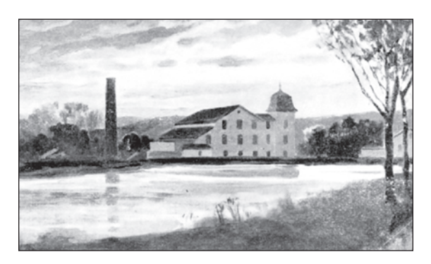
Above: A painting of the Renfrew Mill Right: Hinsdale Brothers Mill, Hinsdale

17 Look up: above you are transmission lines. Now look at the vegetation below. It is mostly shrubs and brambles. Routine maintenance of the vegetation under the transmission lines has reduced the amount of shade on the river, resulting in warmer water which is less beneficial for this river's ecology. Vegetation is also important for holding the soil along the river bank. In 2016, Wahconah High School students planted willow, dogwood, elderberry and sumac to improve shade and reduce soil erosion. BNRC continues to manage this stretch of trail to improve its wildlife value and ensure that the electric utility company