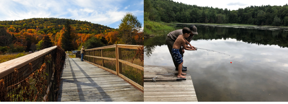
When you conserve your land, it can remain open for recreation—including walking, hiking, biking, hunting, and fishing—according to your wishes.