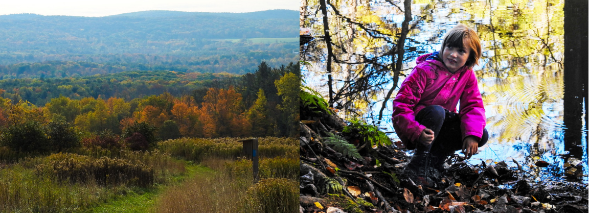
Lands like Hollow Fields in Richmond will remain untouched so that our children and grandchildren can climb hills, spot birds and bears, and play in clear streams.