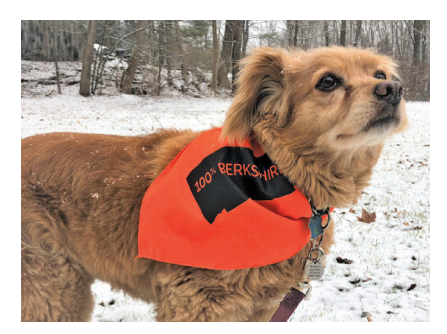
100% Berkshire Dog Bandana $8.00

bnrc.org/store Thank you for being a Landkeeper with BNRC. See you on the trails!